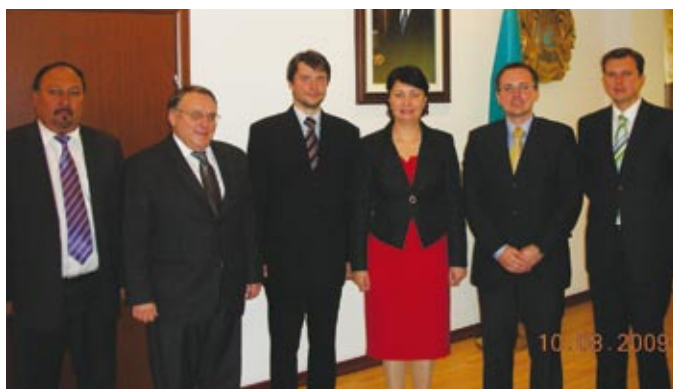
Photo: Minister of Labour and Czech Ambassador, Kazakhstan.

As presented at the Workshop I on illegal migration, return, readmission and reintegration held in Prague on 2-3 July 2009, the first introductory missions took place to Uzbekistan (14-16 June), Turkmenistan (18-20 June) and Tajikistan (22-24 June), during which meetings with state authorities responsible for the fields of migration, as well as international organisations and the representation of the European Commission took place. After the Workshop in Prague, introductory missions to Kazakhstan (10-12 August) and Kyrgyzstan (13-14 August) followed. Representatives of the Czech EU Presidency, the Polish Ministry of Interior and Administration and ICMPD participated in all five missions. Missions to Armenia, Azerbaijan, Georgia, Moldova, Russia and Ukraine are foreseen before the end of 2009. In 2010 the project will continue with substance expert missions to all eleven beneficiary countries.