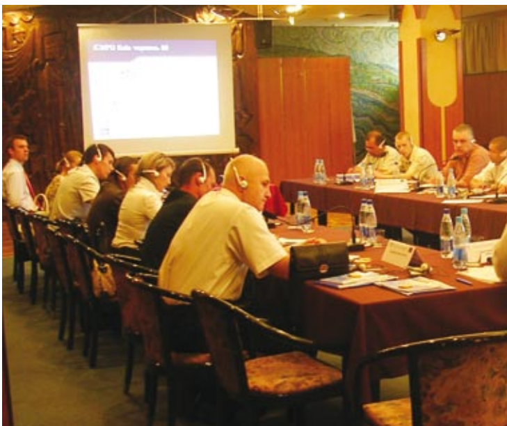
Photo: The workshop underlined the need to develop policies and procedures for forced return in parallel to voluntary return.

The capacity building project GDISC ERIT Ukraine, now in the second half of its implementation, in the last few months offered further opportunities for exchanging experiences between EU state officials and their Ukrainian counterparts on different issues such as reception and screening procedures, visa issuing procedures, interviews of asylum seekers but mainly return processes.