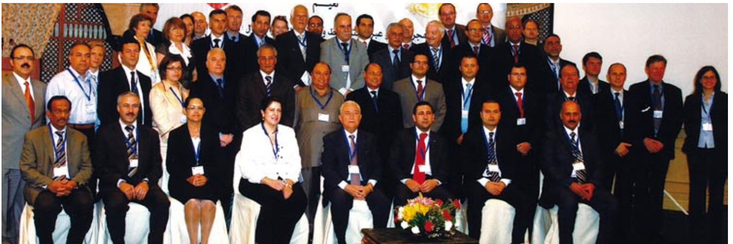
Photo: The MTM i-Map meeting took place in Damascus, Syria, 30 June - 1 July, 2009.

The MTM i-Map project 2009-2010, financed by the European Commission Thematic Programme for co-operation with third countries in the field of asylum and migration, is progressing according to the programme of activities. Content as well as technical improvements are regularly added to the i-Map website www.imap-migration.org . The first MTM i-Map Expert Meeting of the