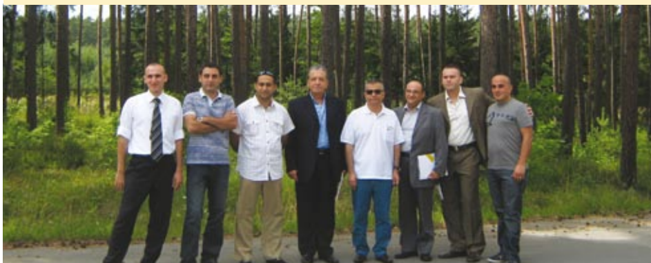
Photo: The Lebanese delegates appreciated the on-the-ground view and understanding of migrant reception and detention in an EU Member State.

Within the framework of the EU-financed "Strengthening Reception and Detention Capacities in Lebanon" (STREDECA) project, ICMPD organised the first of two study visits to EU open and/or closed migrant detention in July 2009 in co-operation with the STREDECA project partners, Caritas Lebanon and UNHCR Lebanon. Hosted by the Refugee Facilities Administration department of the Ministry of Interior of the Czech Republic, the visit provided eight