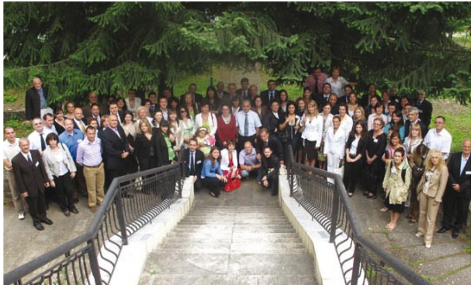
Photo: Family photo of the participants of the final TRM Seminar.

The TRM Guidelines have been elaborated by practitioners from South-Eastern Europe in the framework of the Programme to Support the Development of Transnational Referral Mechanisms (TRM) for Trafficked Persons.