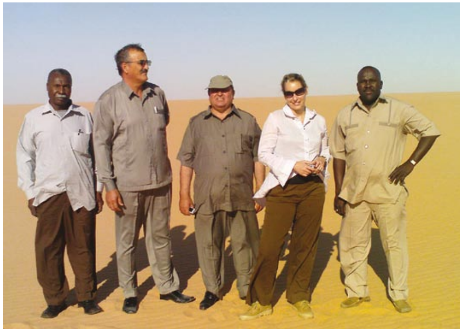
Photo: Members of the ICMPD delegation on their way to the southern border point of Al-Qatroun.

ICMPD's fourth and latest expert assessment mission to Libya within the context of the project “A Comprehensive Survey of Migration Flows and Institutional Capabilities in Libya” was concluded on 26 July, 2009. The mission addressed the topics of border management and trafficking and smuggling. Mission participants and experts, which included two ICMPD staff, one UNODC expert, one Libyan customs official, and the head of IOPCR visited three separate border locations, including Ras Ijdeir to the west of Libya (bordering Tunisia), Am Sa'ad to the east of Libya (bordering Egypt), and Al-Qatroun to the south of Libya (bordering Niger).