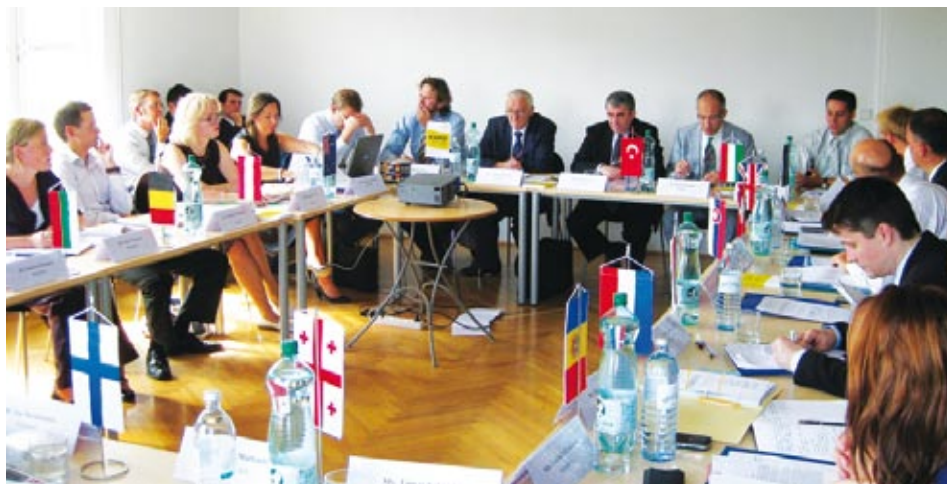
Photo: Friends of the Chair at the ICMPD HQ meeting.