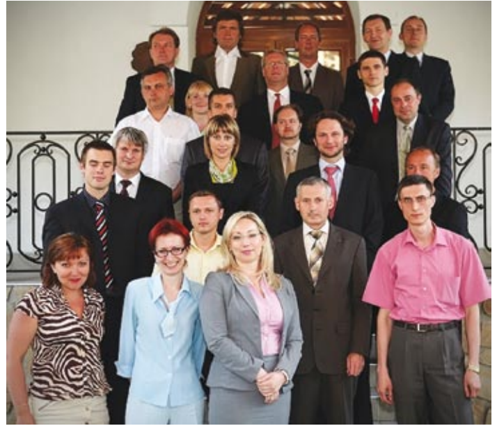
Photo: During the final Conference in Kyiv.

Nationalities and Religions was conducted at the National Academy of the State Border Guard Service of Ukraine. In addition to an instruction video and a training manual, the trainers also received specialised training equipment. Six training sessions for over 120 border, migration and consular personnel held within the project helped the national trainers to enhance their skills and to equip the participants with the necessary skills and knowledge required for the identification of forged and falsified travel documents.