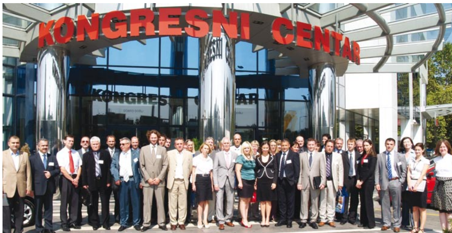
Photo: The Budapest Process Working Group on the SEE region convened in Zagreb.