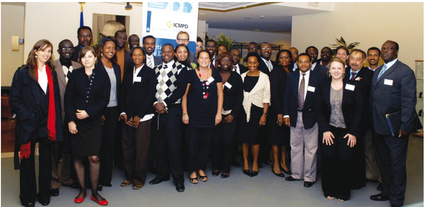
Photo: The Seminar was held at the Borschette Conference Centre, European Commission.

For more information contact: ICMPD-Brussels@icmpd.org