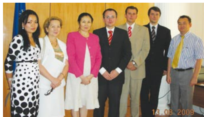
Photo: Deputy Minister of Foreign Affairs, Kyrgyzstan.