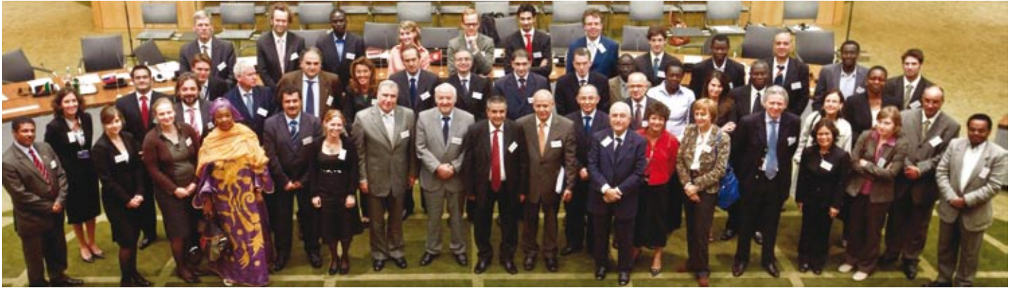
Photo: Delegates at the launch of the project in The Hague, June 2009.

In May 2009 ICMPD and IOM launched the joint project “Linking Emigrant Communities for More Development – Inventory of Institutional Capacities and Practices”.